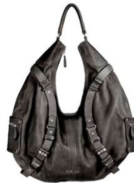
colour »Tasty Olive« /// EUR 298